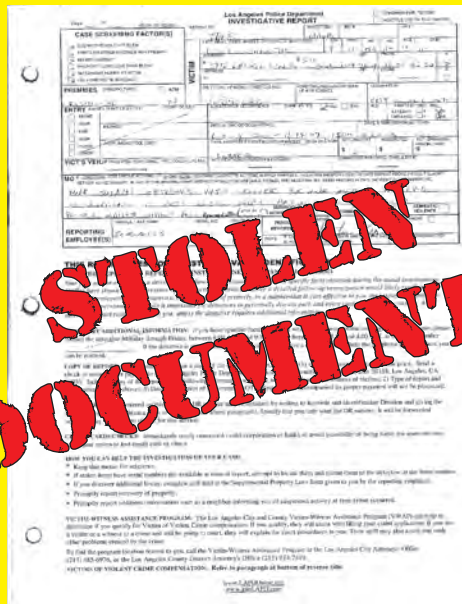
(Police Report, LAPD, North Hollywood Division, 11/21/09)